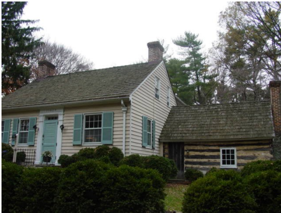
M-NCPPC-owned cultural resources include the Riley House, recognized by historians as the real "Uncle Tom's Cabin."