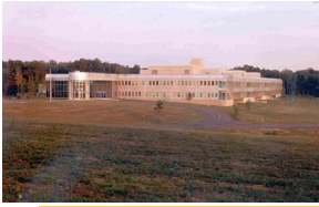
COMSAT Laboratories Building in Clarksburg.